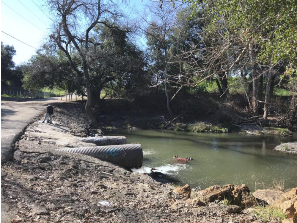
Singleton Road with two small pipes before the new bridge was installed.