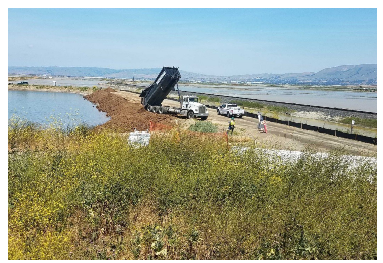
Soil was delivered to Pond A12 for use on future levee construction.