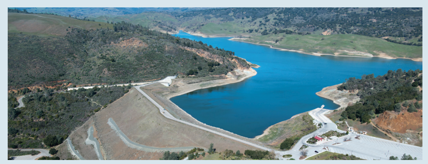
Current photo of Anderson Dam

A real estate agent should be consulted for questions about specific properties. No changes to permanent structures or their use near Anderson Reservoir are