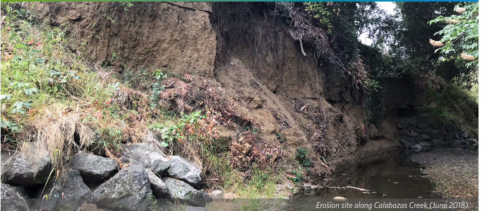
Erosion site along Calabazas Creek (June 2018).