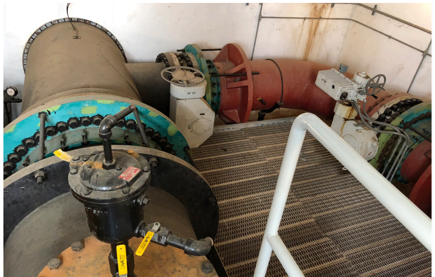
The Cross Valley Pipeline stretches 7.9 miles from the Coyote Pump Plant in Morgan Hill to the Calero Reservoir in San Jose. It runs north-west through unincorporated sections of Santa Clara County. Pictured above is the Calero Modulating Valve Vault, one of the sections slated for inspection and rehabilitation.

Among these efforts is the Cross Valley and Calero Pipeline Inspection and Rehabilitation Project, which is intended to increase the pipeline's reliability and useful life. Crews will enter the pipeline and inspect pipe sections and related accessories and equipment, such as valves and flow meters, and repair or replace defective pieces. Crews will upgrade electrical and control systems, in addition to replacing ladders, vault hatches and corrosion control test stations.