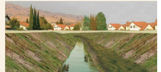
Photo rendering of Calera Creek at North Milpitas Boulevard

The second section of Phase 2 is along Calera Creek, stretching from the Lower Berryessa Creek confluence to the drop structure (see map). This section is in the design phase.