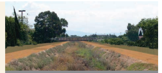
Photo rendering of Tularcitos Creek at Alcosta Drive

This phase is in the planning phase and options, as well as funding, are still being explored. The water district will need to obtain permits from regulatory agencies before constructing Phase 3.