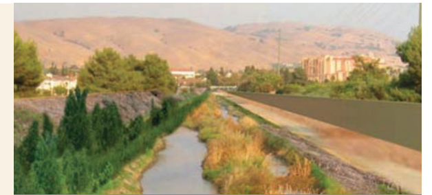
Photo rendering of Lower Berryessa Creek at North Milpitas Boulevard

This phase has two sections. The first section of Phase 2 is along Lower Berryessa Creek, stretching from Abel Street to Calaveras Boulevard. The flood protection improvements for this section include improved earthen levees on the north side of the creek and concrete floodwalls on the south side of the creek. The floodwalls are 12- to 14-feet high from Abel Street to North Milpitas Boulevard, 4- to 8-feet high from North Milpitas Boulevard to North Hillview Drive, and 3- to 4-feet from North Hillview Drive to Calaveras Boulevard. A riparian habitat area will be included within the creek channel. Construction of this section began in 2016 and is scheduled to be completed simultaneously with the Upper Berryessa Creek portion of the project in 2018.