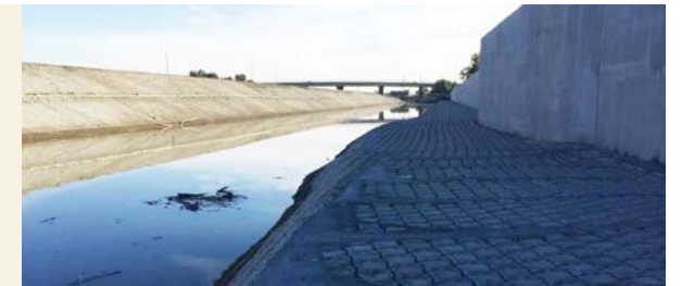
New concrete floodwalls constructed along the west levee of Lower Berryessa Creek facing south. Abel Street Bridge is shown in the background.

This phase stretches from the confluence at Lower Penitencia Creek to Abel Street. The flood protection improvements for this phase include earthen levees on the east and north sides of the creek and 6- to 9-foot concrete floodwalls on the west and south sides of the creek. Revegetation of freshwater wetlands was established within the creek channel. Construction of Phase 1 was completed in December 2016.