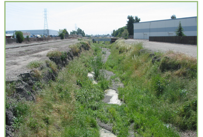
Erosion has been an ongoing issue along Berryessa Creek. The water district and the Corps will address this problem and provide a 100-year level of protection.