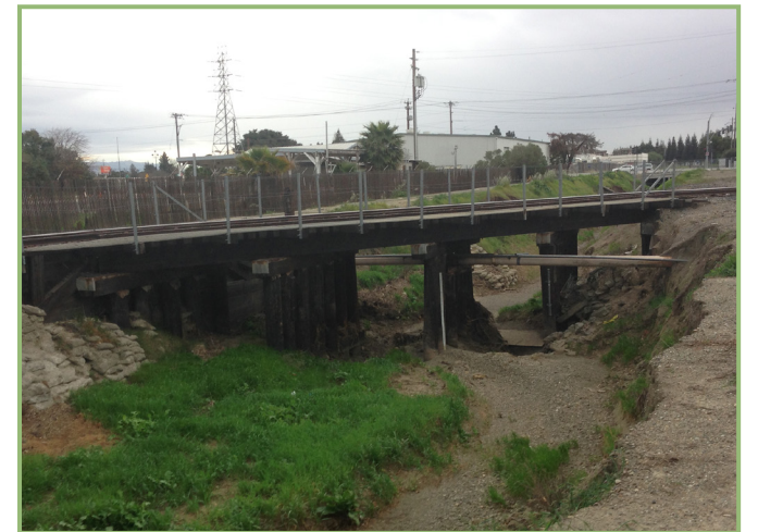
Plans include replacement of the Union Pacific Railroad Bridge that currently restricts water flows during high storm events.

An independent monitoring committee reviews the water district progress on accomplishing the plan. The annual report is available at www.valleywater.org .