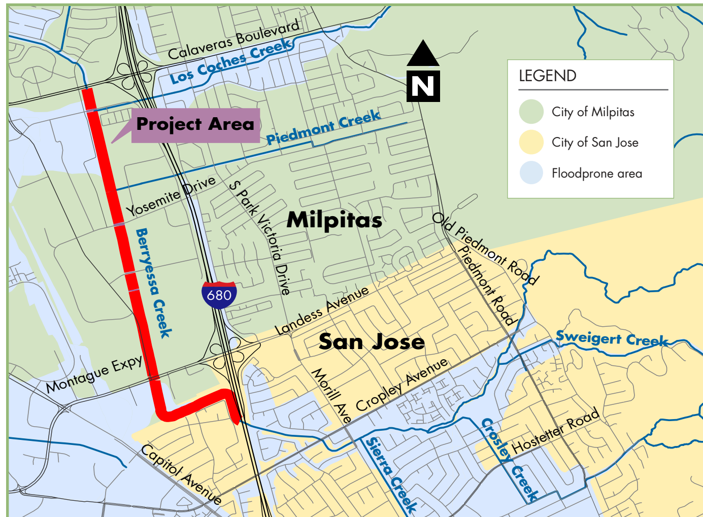
The Berryessa Creek Flood Protection Project extends 2.2 miles from Calaveras Boulevard to Interstate 680.