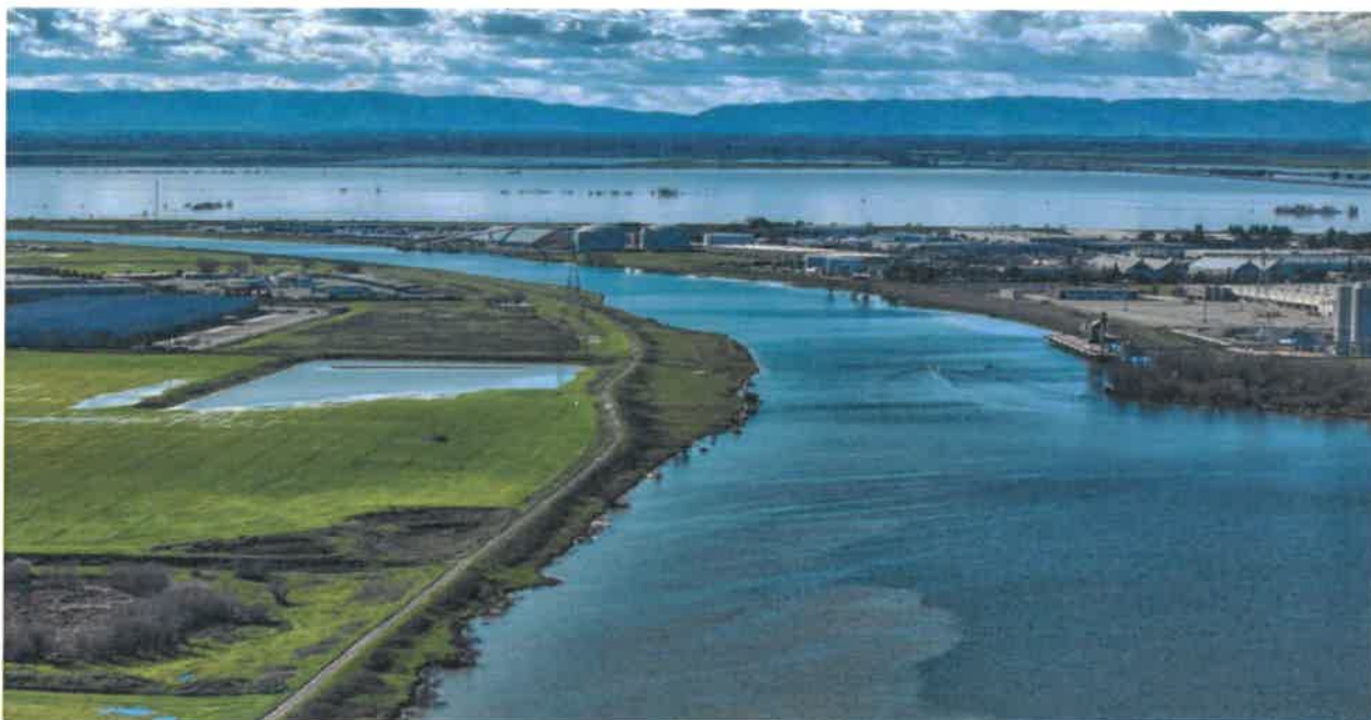
San Joaquin-Sacramento Delta, west of Sacramento.