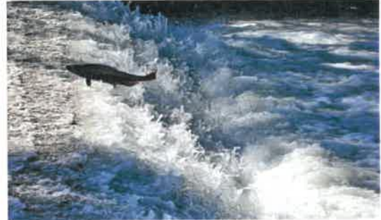
Fig. 5 – Reclamation is committing more than $15 million dollars to support listed species.

In July 2019, NMFS provided a draft conclusion that Reclamation and DWR's proposed operation of the CVP, as described in the January 2019 Biological Assessment, would likely jeopardize the continued existence of Sacramento River winter-run Chinook salmon, Central Valley spring-run Chinook salmon, California Central Valley steelhead and would adversely modify their critical habitats. The USFWS did not provide draft conclusions during the consultation process, but also expressed serious concerns about impacts to delta smelt and its habitat. In response, Reclamation and DWR made several additional significant commitments to support listed species: