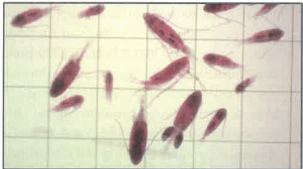
Fig. 8-12 – New science considered in developing a Proposed Action considered a range of fish life stages across the CVP and SWP.