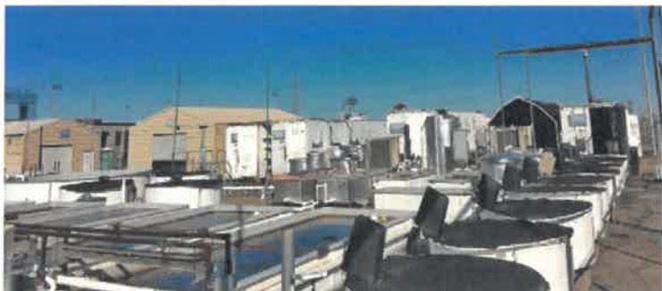
Fig. 6 (left) - U.C. Davis Fish Conservation and Culture Laboratory (UCD FCCL) near Tracy, CA at the SWP Skinner Delta Fish Protective Facility

Reclamation will fund a process that will lead to supplementation of the wild delta smelt population with captive-bred fish from FCCL within 3-5 years. A supplementation strategy will be developed within one year of the issuance of the BiOp that will include details about the capacity needed at FCCL to accommodate production of delta smelt needed to meet genetic and other hatchery considerations with a goal of increasing production to a number and the life stages necessary to effectively augment the population. Additional funding will support expansion of the FCCL facilities to increase rearing capacity to provide up to approximately 125,000 adults within 3 years.