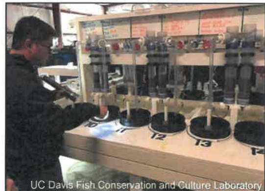
UC Davis Fish Conservation and Culture Laboratory