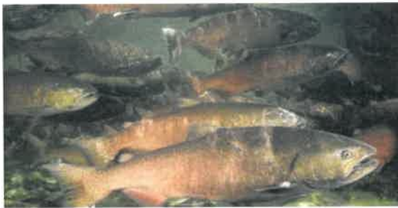
Fig. 1 - Winter-run Chinook salmon, as well as Green Sturgeon, Steelhead, and Spring-Run Chinook Salmon

Historically, spring-run Chinook salmon were the second most abundant salmon run in the Central Valley and one of the largest runs on the west coast. The Central Valley drainage as a whole is estimated to have supported spring-run Chinook salmon runs as large as 600,000 fish between the late 1880s and 1940s. Historic California Central Valley (CCV) steelhead run sizes are difficult to estimate but may have approached one to two million adults annually; by the early 1960s, the CCV steelhead run size had declined to about 40,000 adults.