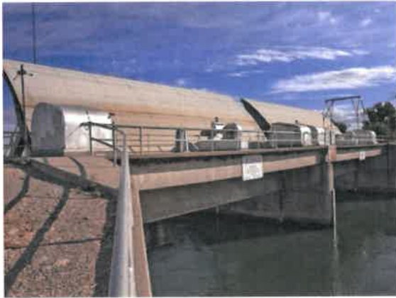
Fig. 3 - Closures of the Delta Cross Channel Gate prevents entrainment of many fish into the poor habitat of the central and south Delta and reduces salvage.

1 under the proposed action as compared to operations under the 2009 BiOp. During the consultations, the Services both expressed concerns about the changes in Delta export operations being proposed by Reclamation and DWR.