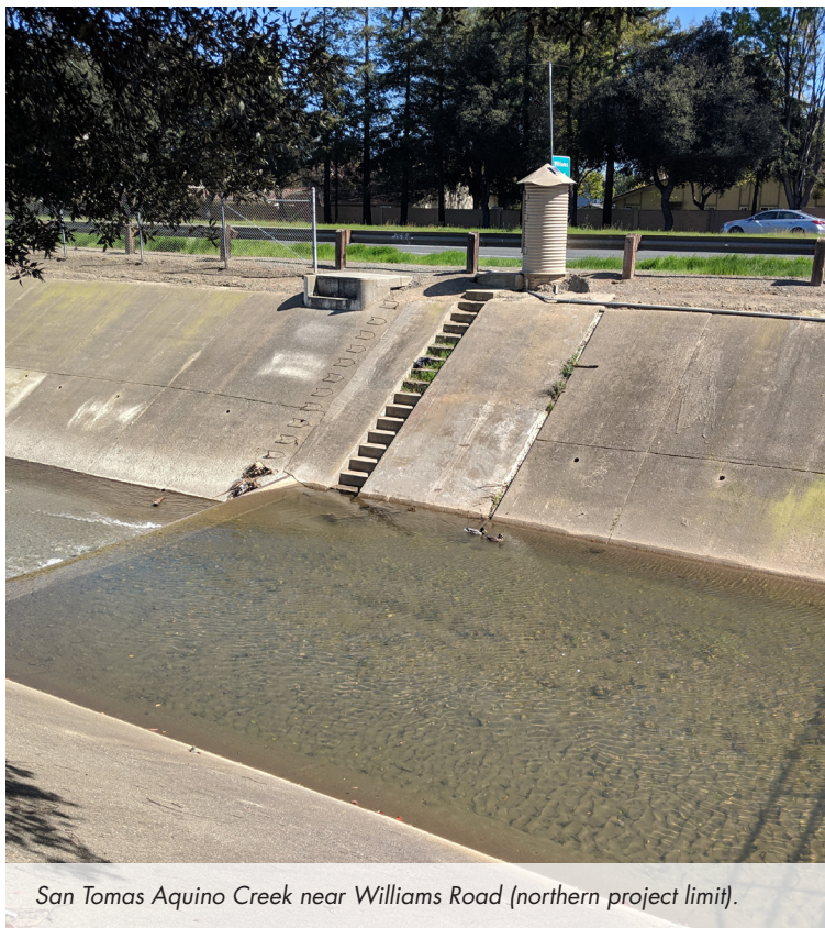
San Tomas Aquino Creek near Williams Road (northern project limit).

Residents can expect typical construction noise, dust from operating heavy equipment, and an increase of traffic volume near the project site limits and on San Tomas Expressway. Traffic control efforts, and temporary lane closures on San Tomas Expressway are also anticipated. Construction crews and equipment will be accessing the creek through gates at Payne, Hamilton, Campbell, Rincon and Virginia Avenues. Crews will be parking vehicles and equipment at an identified site off Virginia Avenue.