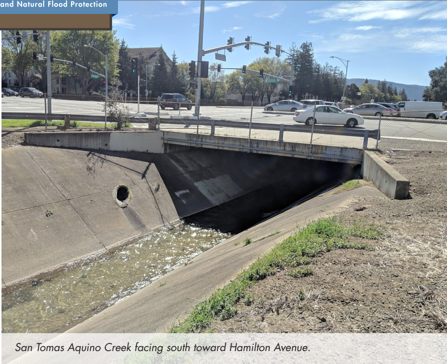
San Tomas Aquino Creek facing south toward Hamilton Avenue.