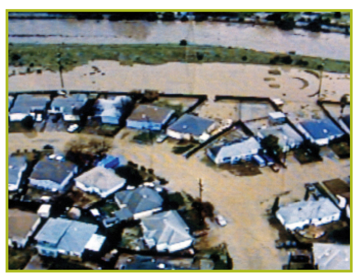
San Francisquito Creek downstream of Highway 101

Features include a widened creek channel into the Palo Alto golf course, enhanced connectivity between the creek and adjacent marsh and improved access to trails and existing marsh habitat, including on a horizontal levee adaptable to sea level rise. New native vegetation will include tidal marsh, with pickleweed as the primary species as it is critical to salt marsh harvest mouse as habitat and food. Gumplant will be the predominate species in the transitional areas, providing important cover for the mouse and rail during high-tides. Other native species will be planted to increase diversity.