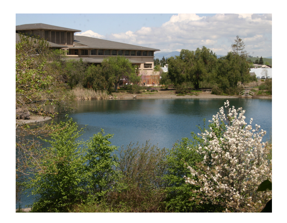
Photo: Los Alamitos Recharge Pond located behind Valley Water Headquarters

As part of the annual budgeting process, the Board conducts planning sessions to develop strategies to accomplish Valley Water's long-term goals and objectives. This fiscally responsible and balanced budget meets the community's expectations of Valley Water while also adapting to the COVID-19 pandemic. The budget was developed based on the Board's current strategies; the FY 2020-21 Board Work Plan will be approved in the near future, and will serve as a road map for the year ahead and guide the preparation of future budgets.