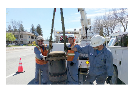
Parallel East Pipeline Refurbishment