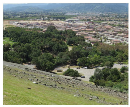
Anderson Dam during Division of Safety of Dams (DSOD) inspection

Key deliverables: Complete construction of the Cross Valley and Calero pipelines. Advertise and award construction contracts for the Parallel East Pipeline Phase II and Central Pipeline.