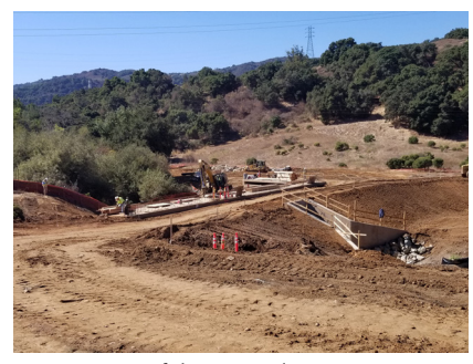
Construction of the Control Structure at Rancho San Antonio

Watersheds will also complete construction of the Rancho San Antonio Park Flood Detention Facility and the Berryessa Creek Flood Protection Project. Construction will begin for San Francisco Bay Shoreline Phase I to provide flood protection and tidal wetland restoration, as well as for Piedmont Creek Wall Repair and Rehabilitation and Calabazas Creek Bank Rehabilitation.