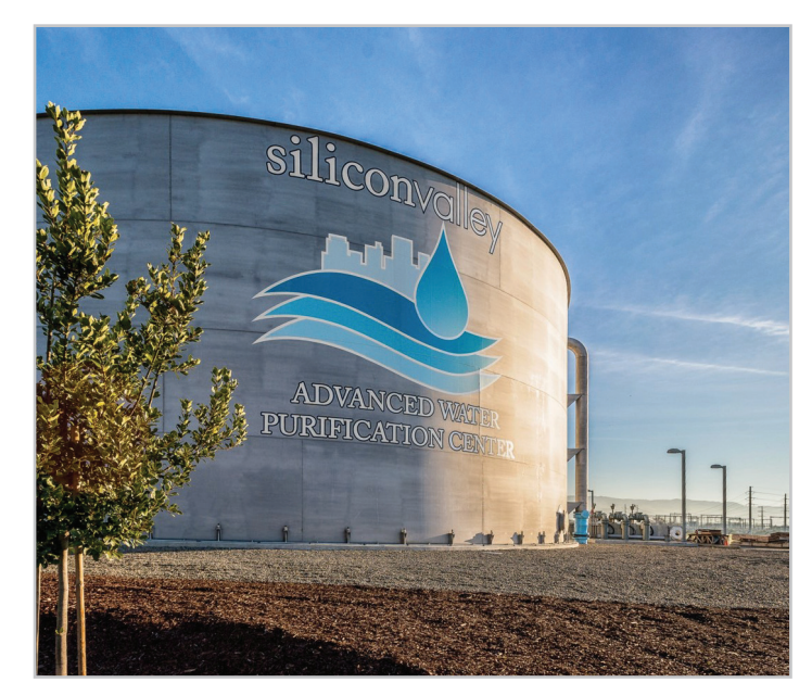
Silicon Valley Advanced Water Purification Plant.

When completed, this project will build a facility capable of providing at least 10 million gallons per day of high-quality, drought-resilient water.