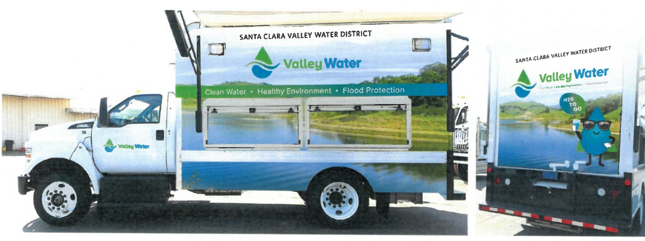
Proposed new water truck design