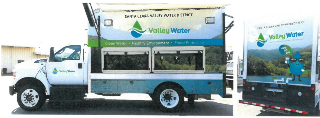
Previously approved water truck design