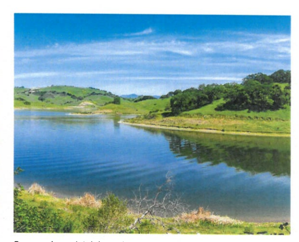
Proposed new backdrop photo (Calero Reservoir)