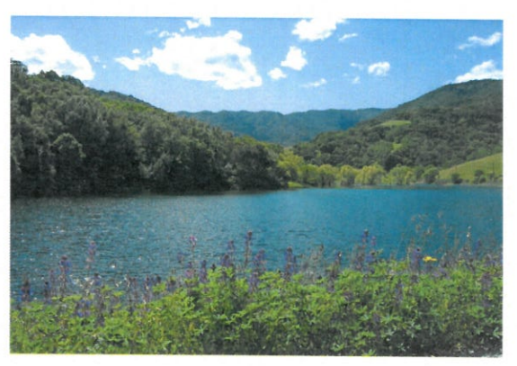
Previously approved backdrop photo (Almaden Reservoir)