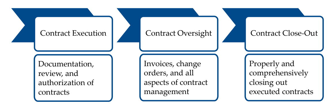
Figure 1. Approach to Compliance Audit

At the highest level, focus areas associated with the tasks in the consultant contracts compliance audit included the following: