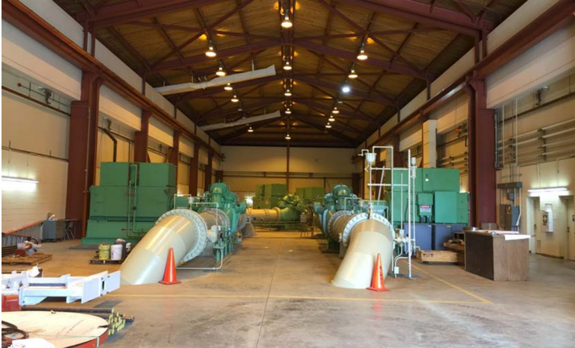
Coyote Pumping Plant ASD Replacement