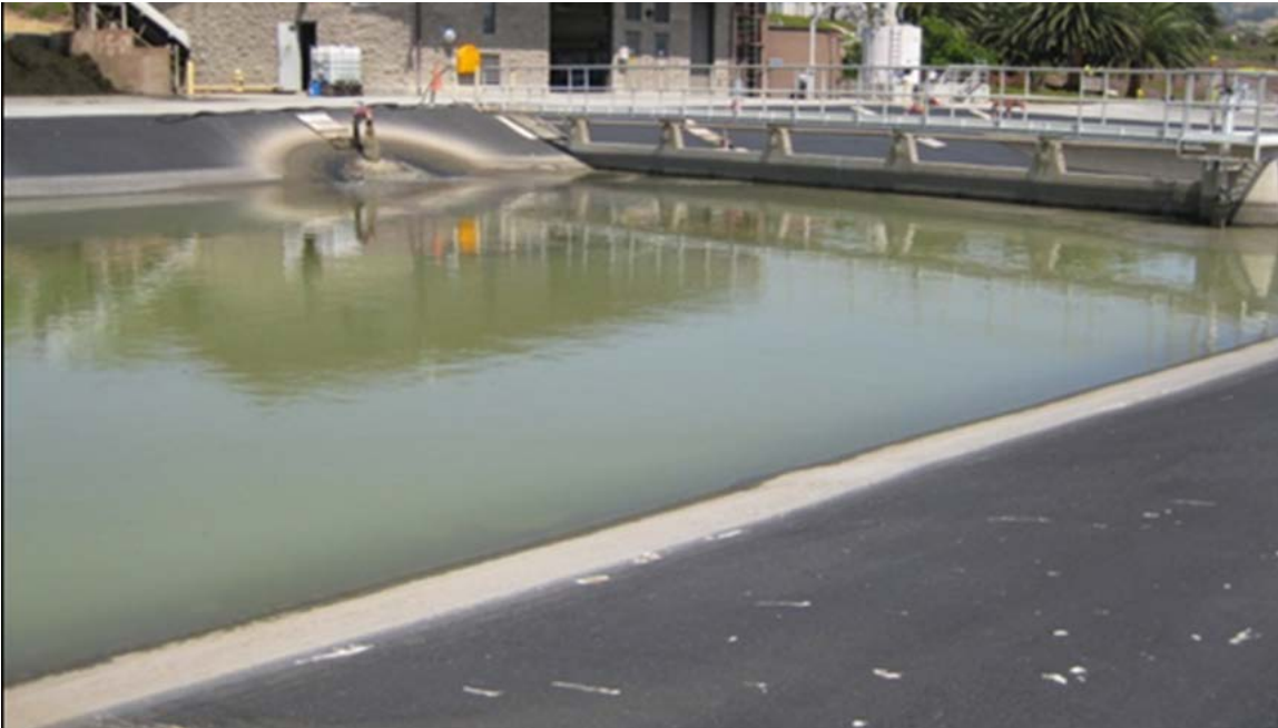
Existing settling pond