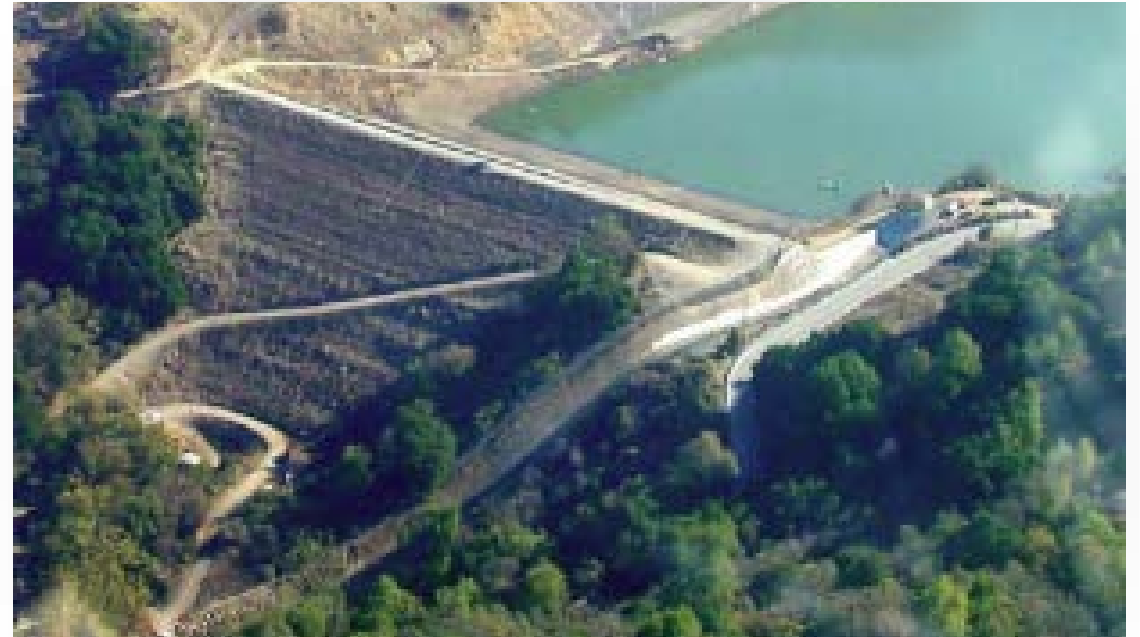
Guadalupe Dam 3,415 acre-feet