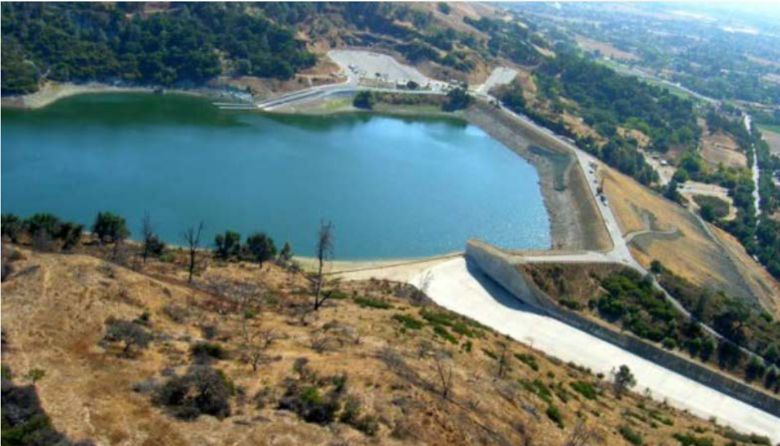
Anderson Dam 90,373 acre-feet