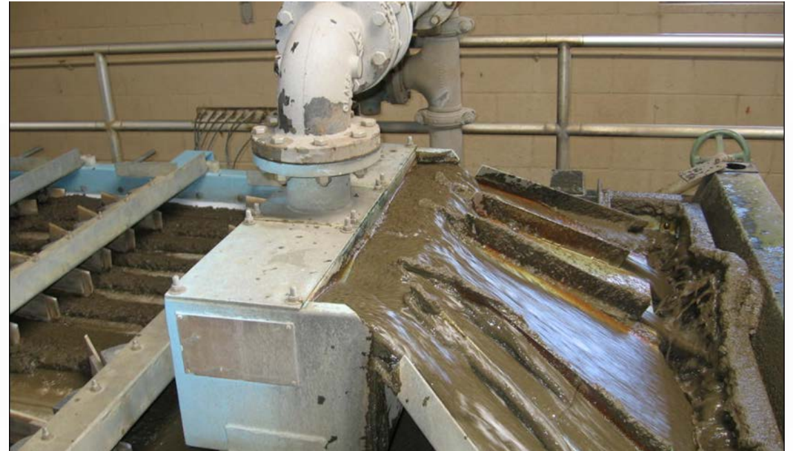
Existing belt press