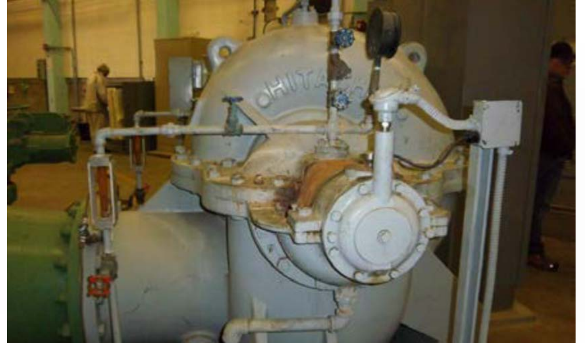
Vasona Pumping Station Upgrade