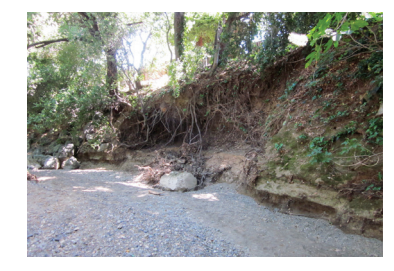
Before Erosion Repair