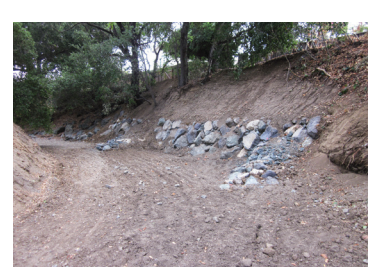
After Erosion Repair