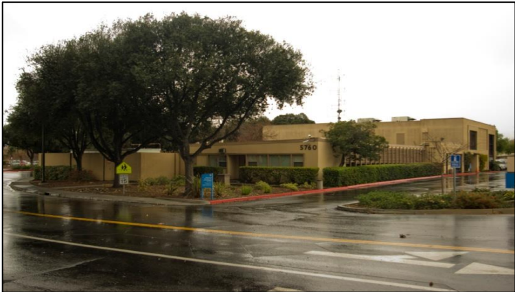
Existing Maintenance Building