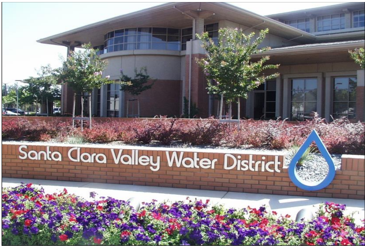
Front view of the Headquarters building at the Almaden Campus

Project Facility Management, Small Capital Improvements Program Buildings and Grounds Project No. 60204016 Contact Jesse Soto jsoto@valleywater.org