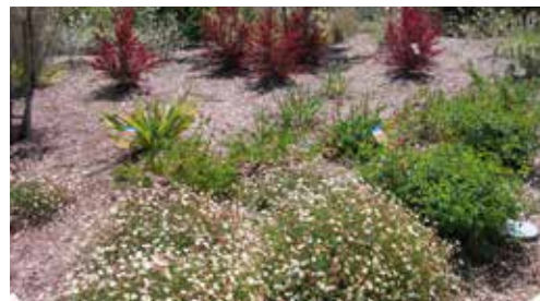
Fleabane, Tea Trees and others

Please enjoy a Self-Guided Walking Tour through our garden. A map is provided on the reverse side of this flyer. Keep an eye out for Plant Markers. They can tell you important information, such as: