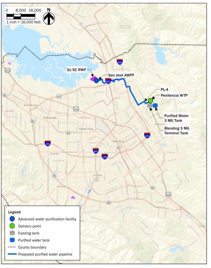
Delivery point to City of Sant Clara Delivery point to City of Santa Clara Delivery point to City of Santa Clara Delivery point to Valley Water