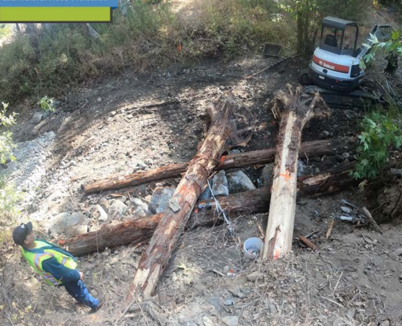
Crews will install anchored logs into the Los Gatos Creek. Strategically placed logs can give fish places to rest and evade predators.

Safe, Clean Water and Natural Flood Protection