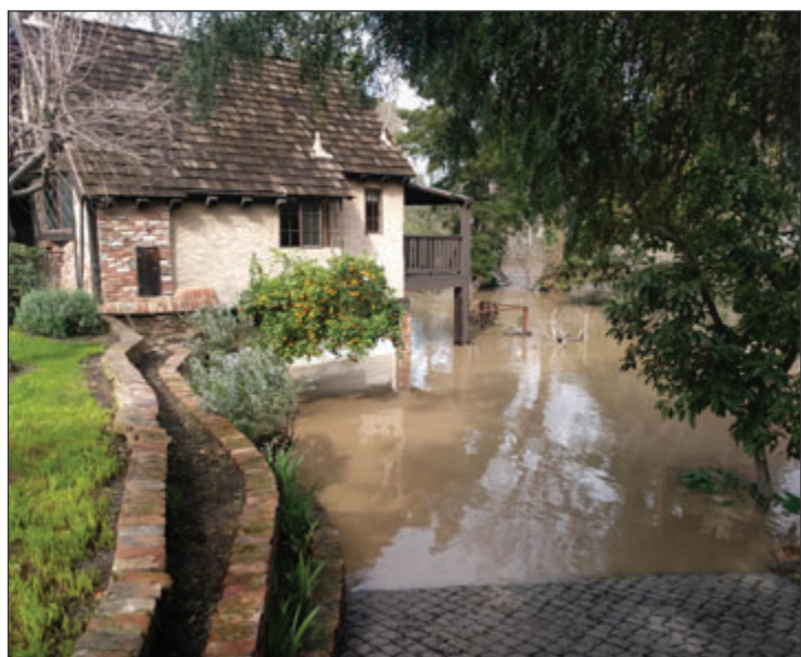
Driveway flooding.

Managing whole watersheds, with an eye for One Water integration, will be critical in creating the kind of flexibility and resilience in water resources management necessary to mitigate and adapt to uncertainties and unforeseen impacts. Climate change is important across all business areas for Valley Water and so is addressed by functional areas within its attributes and metrics.