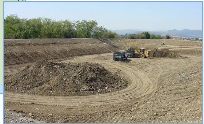
Similar work completed in Morgan Hill to remove sediment from groundwater recharge ponds.