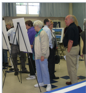
Scoping meeting held in Los Altos. May 19, 2007.

November 22 Permanente Creek Planning Study at Castro Elementary School