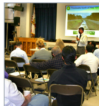
Scoping meeting held in Mountain View. May 16, 2007.

December 9 Mtn. View City Council culminated the master planning process for Cuesta Park Annex with a decision to approve flood detention in the northern portion of the Annex