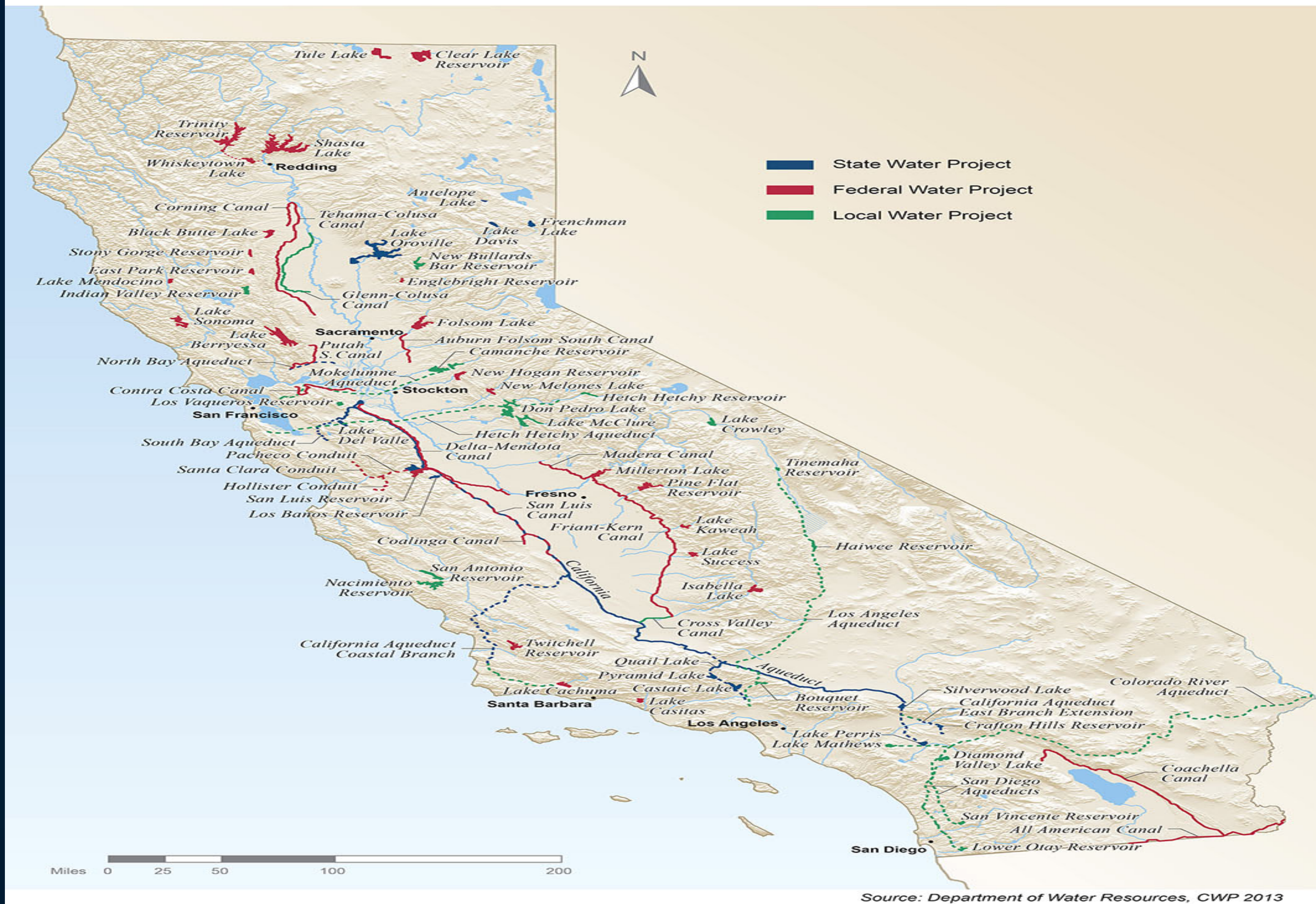
Figure 3-2: Major Rivers and Facilities