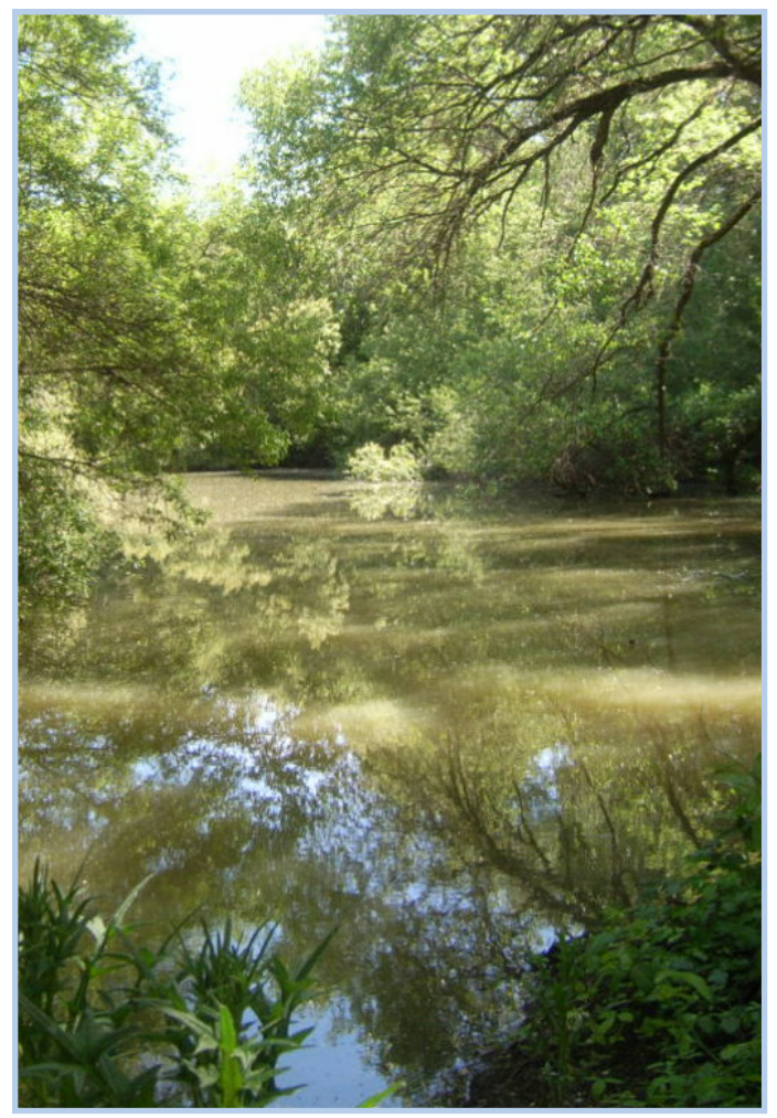
Streamside vegetation, Pajaro River in South Santa Clara County.

Tree removal on private property may be subject to local city or county permits. For tree pruning or removal along creeks, owners may be required to secure permits from regulatory agencies such as the California Department of Fish and Wildlife, www.wildlife.ca.gov.