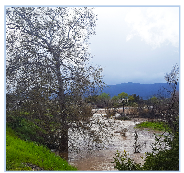
Guadalupe River between Blossom Hill Rd. and Almaden Lake Park, San Jose.