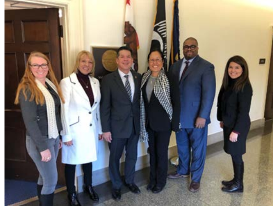
Washington, D.C. Trips: April 1-3, November 12-14