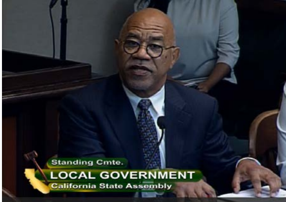
AB 707 (Kalra) Valley Water Contracting Threshold