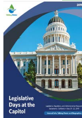
State Legislative Days: May 21-22