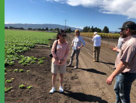
Farm Bureau Tour